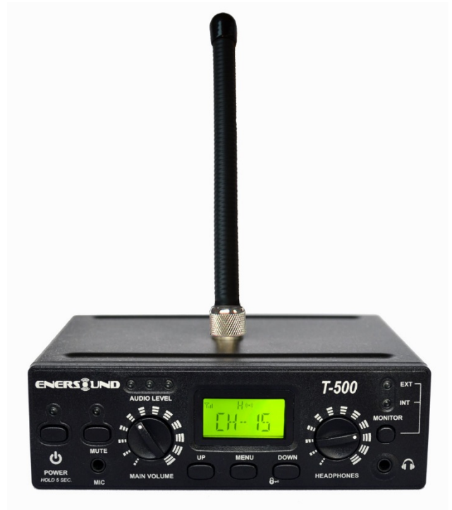
Front view (with antenna)