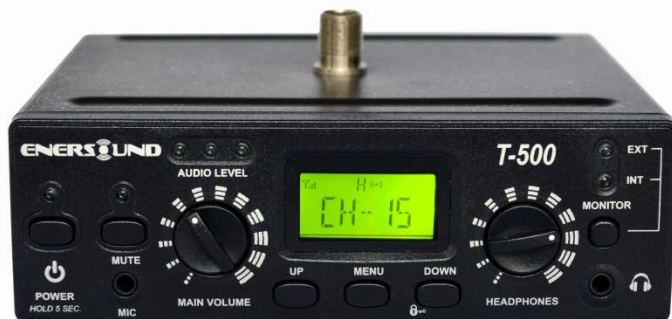
Front view (without antenna)

This 17-channel professional FM transmitter can be used for assistive listening and language interpretation. It wirelessly broadcasts a speaker's voice, music or any audio signal up to 1000 ft. The audience can use the optional R-120 FM multichannel receiver or any other compatible FM receiver operating on the 72-76 MHz frequency to pick up the broadcast.