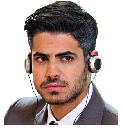
EAR-120 Dual Headphones

1-year warranty on headphones & microphone.