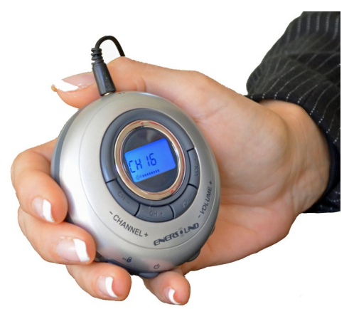
R-120 Multi hannel FM Receiver