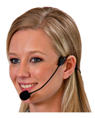
MIC-200SEN Interpreter Microphone