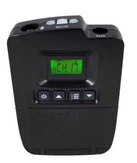
TP-600 Multichannel Battery-Operated Transmitter