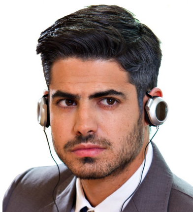
EAR-120 Dual Headphones

Limited lifetime warranty on receivers and transmitter. See manufacturer website for more details. 1-year warranty on headphones & microphone.