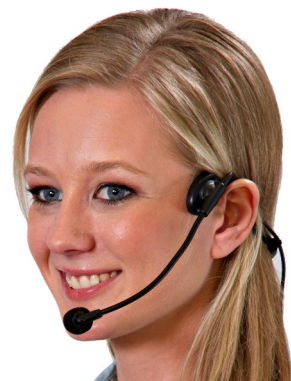
MIC-300 Pro. Interpreter Microphone