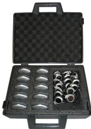
Optional CAS-10 Carrying Case $89.00 (MSRP: $ 147.00)