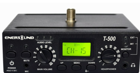
T-500 Multichannel Base Transmitter