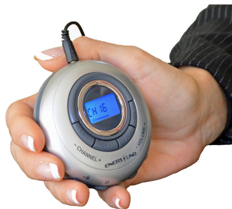
R-120 Multichannel FM Receiver