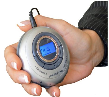
R-120 Multichannel FM Receiver