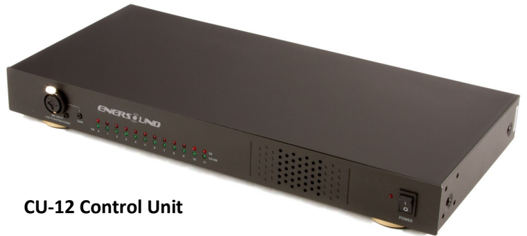
CU-12 Control Unit