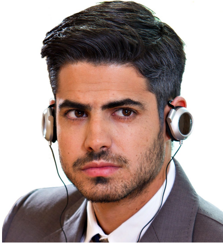
EAR-120 Dual Headphones