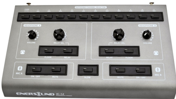
IC-12 Interpreter Console