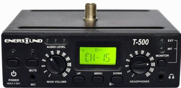
T-500 Multichannel Base Transmitter

Note: This system requires a human language interpreter, it does not translate automatically.